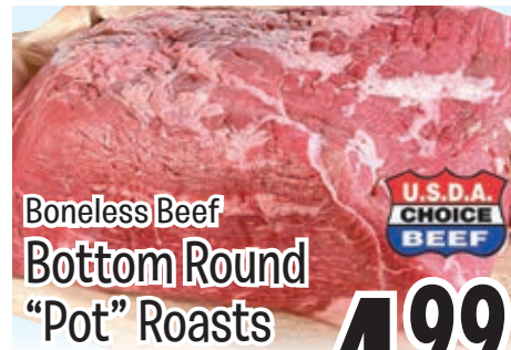
Boneless Beef Bottom Round "Pot" Roasts U.S.D.A. Choice Beef Trimmed To Perfection • Born, Raised & Harvested In The U.S.A.