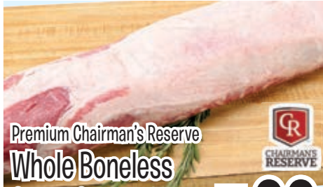
Premium Chairman's Reserve Whole Boneless Center Cut Pork Loin

At Brookside, you can always be sure that our Beef & Veal is U.S.D.A. Choice, and our Pork is hand selected & trimmed - deep pink - perfectly marbled, and ALL of our fresh Meat is trimmed to perfection and born, raised & harvested in the U.S.A.!