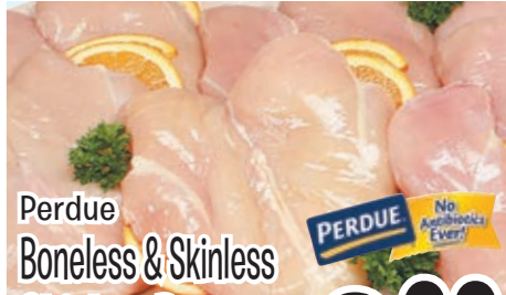
Perdue Boneless & Skinless Chicken Breasts