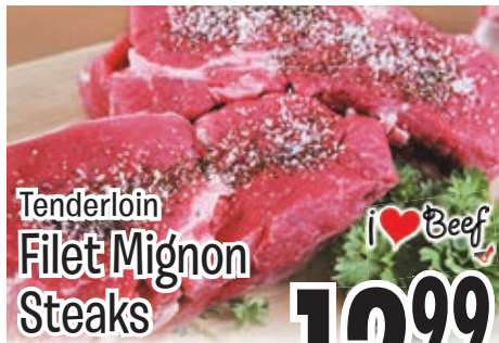
Tenderloin Filet Mignon Steaks Brookside's Angus Beef Trimmed To Perfection Western U.S.A. Born & Raised