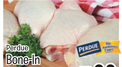
Perdue Bone-In Chicken Thighs