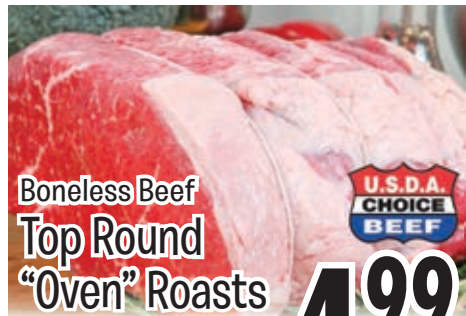
Boneless Beef Top Round "Over" Roasts U.S.D.A. Choice Beef Trimmed To Perfection • Born, Raised & Harvested In The U.S.A.

Brookside's Chicken is all natural, and our Pork is hand selected & trimmed - deep pink - perfectly marbled, and ALL of our fresh Meat is born, raised & harvested in the U.S.A.!